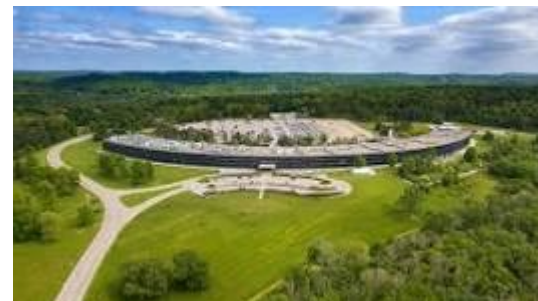
Eero Saarinen TJ Watson Research Ctr

1968 Yorktown Hgts 1988 Toronto 1990 San Antonio. OJ 1992 tacit 1999 Palo Alto